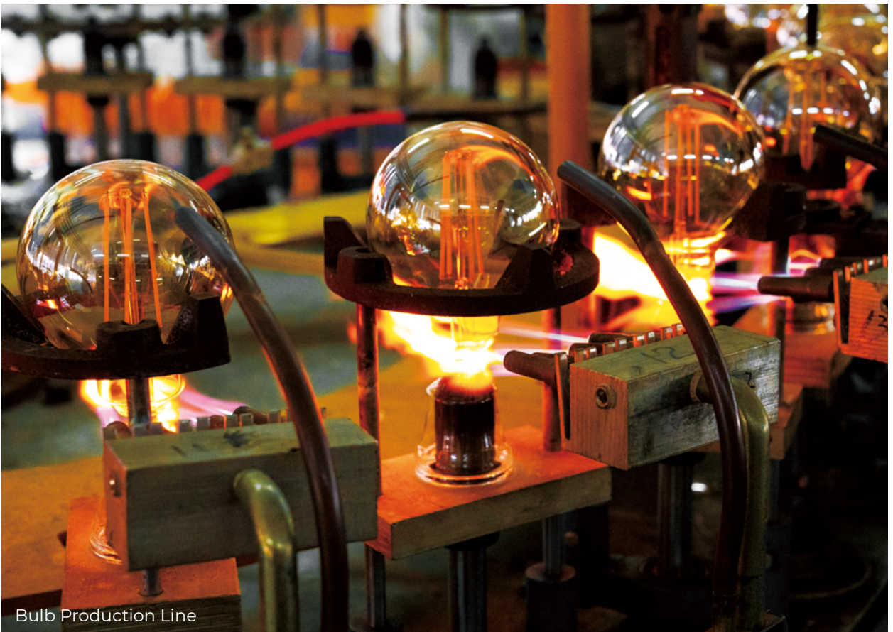
Bulb Production Line