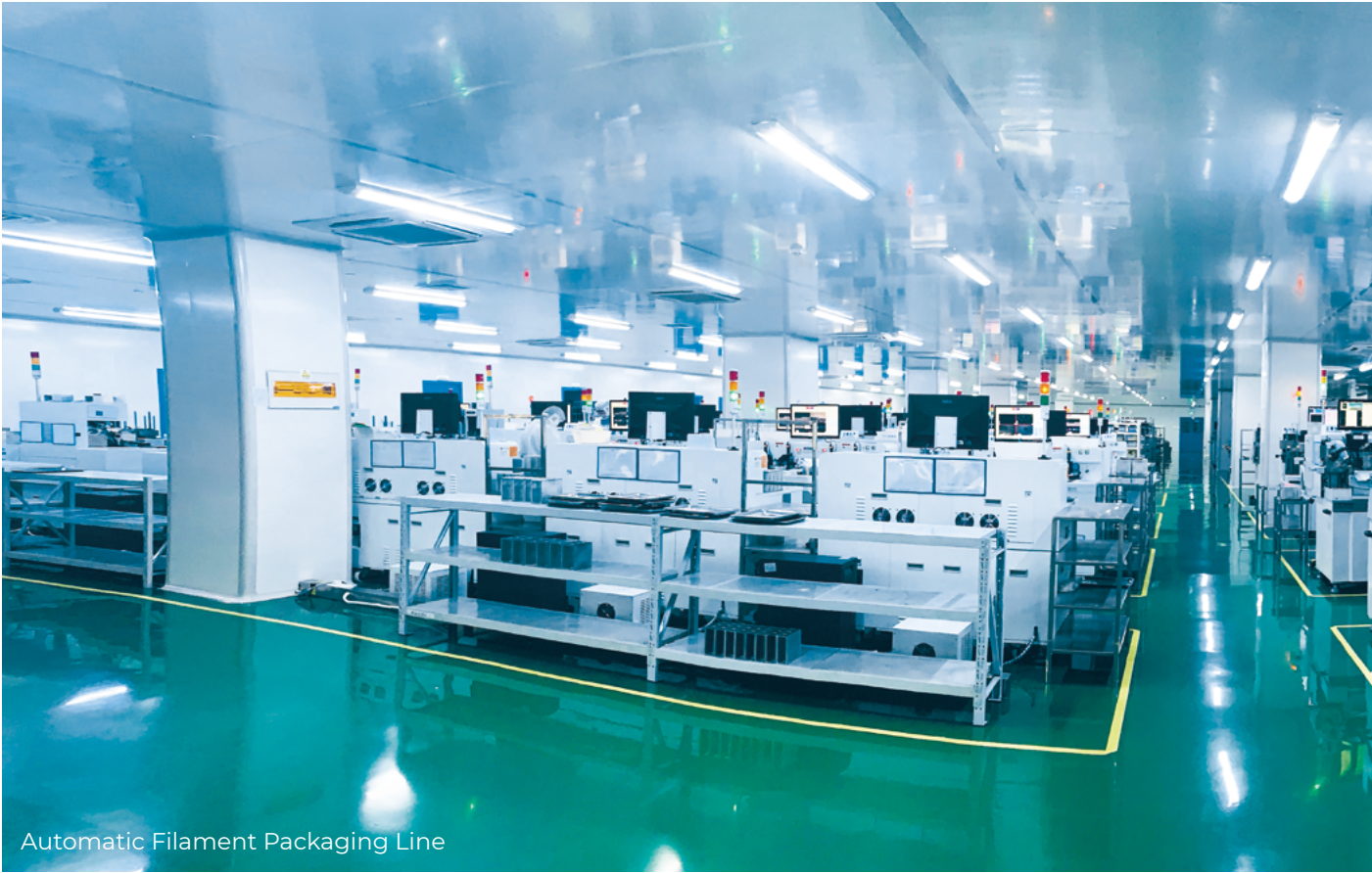
Automatic Filament Packaging Line